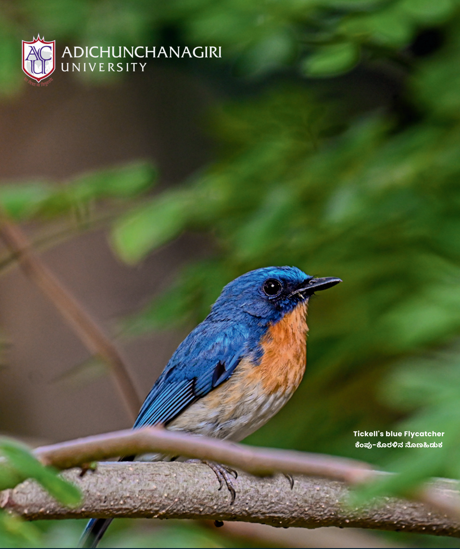
Tickell's blue Flycatcher ಕೆಂಪು-ಕೊರಳಿನ ನೊಣಹಿಡುಕೆ

Adichunchanagiri University is a sprawling 67-acre campus home to over 4,585 trees, which produce a whopping 99.75% of the oxygen in the area every year and also provides shelter for 36 different bird species, 4 butterfly species, and 6 different types of snakes